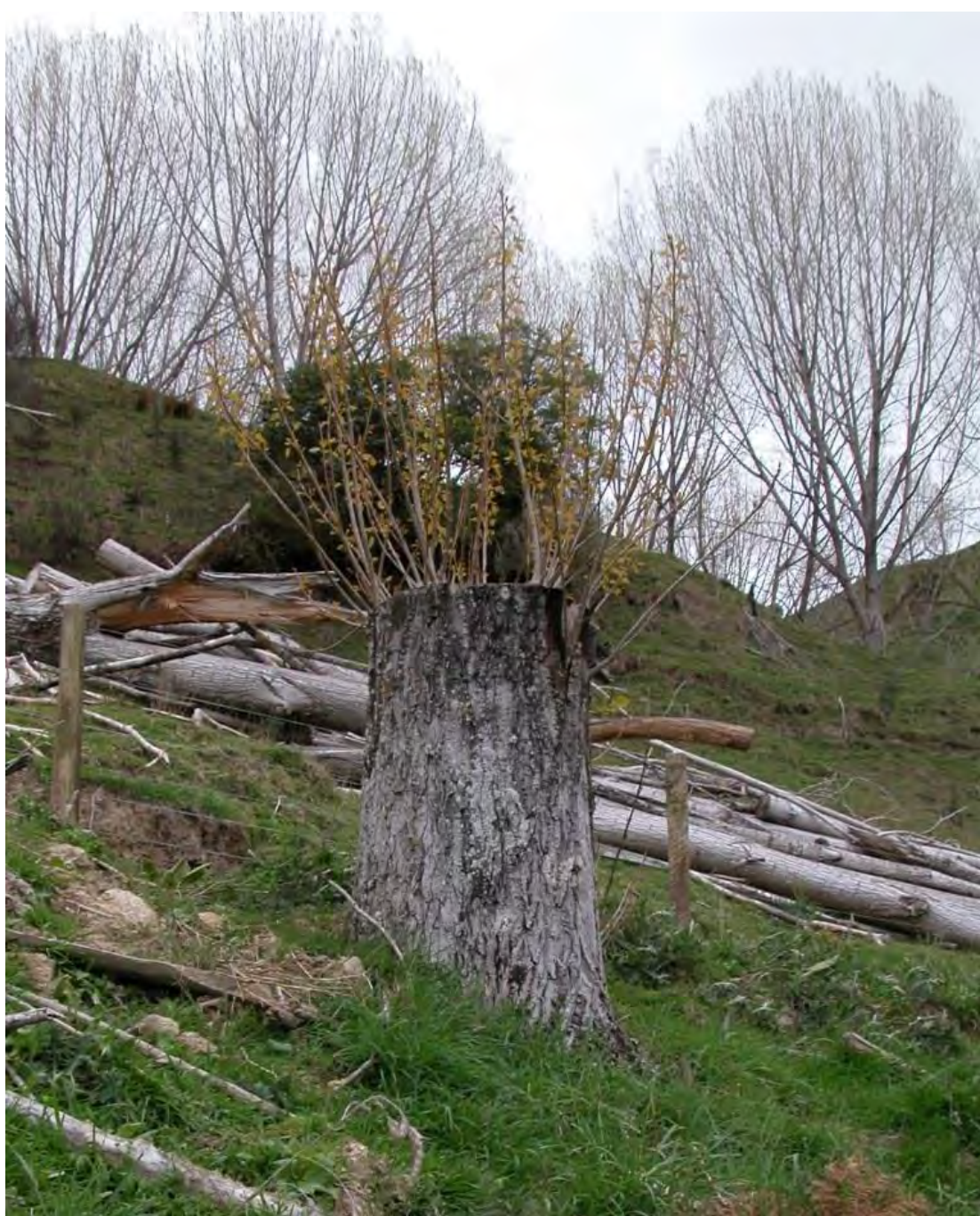
Figure 1. Felled poplars will resprout and grow readily in the absence of browsing animals.

There is much discussion about how to reduce the risk associated with the presence of large poplars and willows, and in particular, how to remove them where it is difficult to get machinery access.