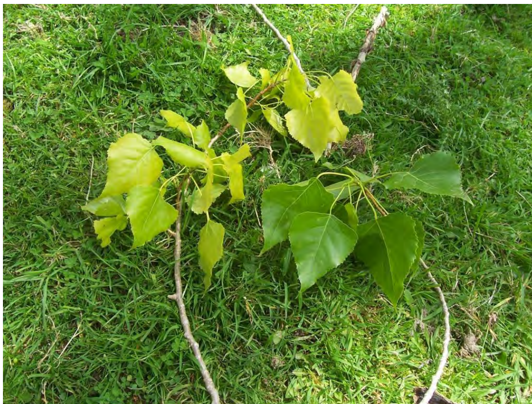
Figure 3. Live leaves on trees treated with herbicide show yellowing from chlorosis compared with normal leaves.