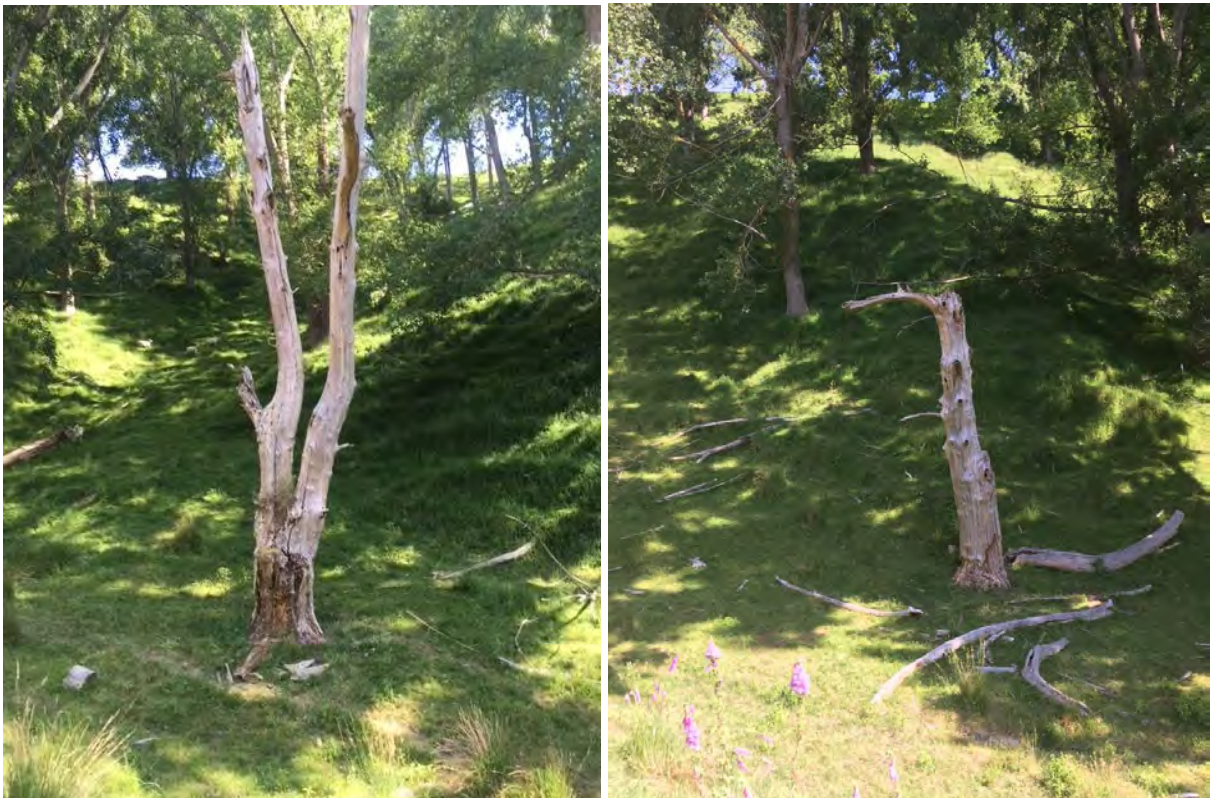
Figure 8. Poplars poisoned 10 years previously showing the gradual disintegration and woody debris around the tree.