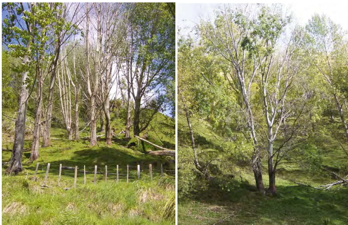
Figure 4. Trees dead from poisoning (L). Where two trees are close together (R) root grafts may translocate herbicide from a treated tree to an untreated tree and possibly kill it too.