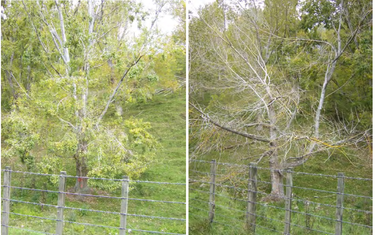
Figure 7. With inadequate treatment (L) foliage remains on the tree six months after application of herbicide, whereas with adequate treatment no leaves are present and light to pasture has increased dramatically.