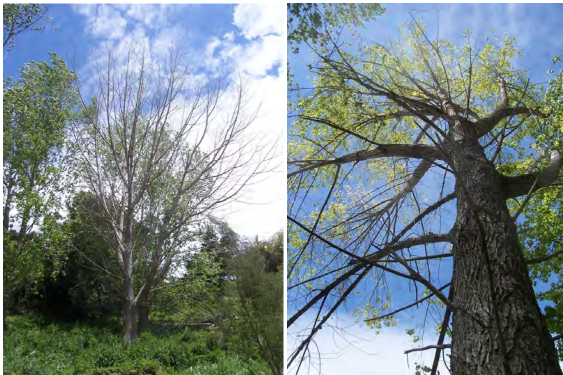
Figure 2. Poplar poisoned in February (L) has <1% leaf in the following December compared with a poplar poisoned in April (R, 10–25% leaf), and an untreated poplar (background tree in both pictures).