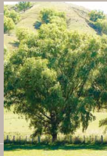
Matsudana Salix matsudana

This has bright yellow branchlets that are more conspicuous with regular pruning. The tree grows to 15 m high, is semi-weeping in form, and is a great shade tree.