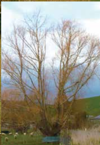
Golden willow S. alba 'Vitellina'

This has bright yellow branchlets that are more conspicuous with regular pruning. The tree grows to 15 m high, is semi-weeping in form, and is a great shade tree.